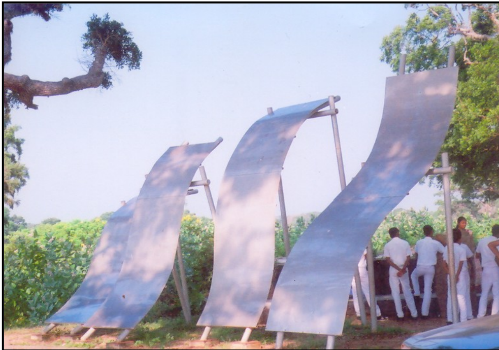
Memorial in Sri Lanka honoring the lives lost in the tsunami of 2004.

“The day the tsunami hit, first the water rushed away from the shore. Some rushed out with sticks to mark out what would be their land. But then the waves came back in, four of them, washing away their hopes and claiming their lives.” This tragic story, told to us by a survivor of that 2004 tsunami that killed 30,000 people, explained the memorial on that beach in eastern Sri Lanka. But not far along the shore we saw new houses built by “Back to Life,” and people rebuilding their lives. What were we doing in Sri Lanka? One of the reasons was to volunteer with Y GRO, a mission supported by our church helping other people rebuild their lives from a man-made disaster.