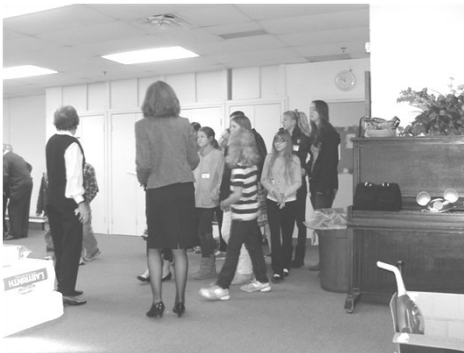
Youth get their marching orders ...

Greentree Shelter, in Bethesda, MD, serves as a transitional home for homeless families, primarily children with single mothers, and provides the basic support systems necessary for families to rebuild their lives. They operate two daycare centers and will make good use of the toys so generously donated by members of this congregation.