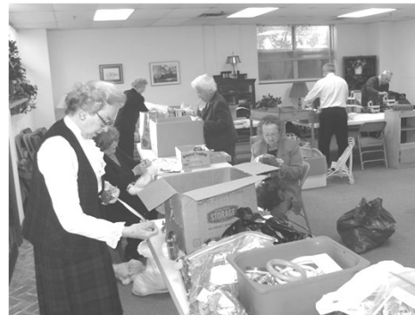
Adults set the stage ...

On Sunday, December 5 th , 14 adults and 18 youth came together to prepare gently used toys for needy children served by Greentree Shelter, and by 10:30 a.m. they had processed a truckload of lovable goodies.