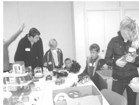
Careful sorting ...